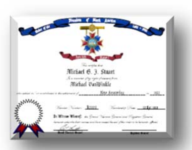
The following new members have been approved since our last publication.