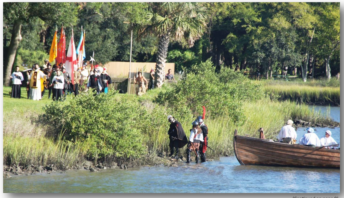
(Continued on page 9)